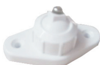
MB-100: Rotating wall mount bracket